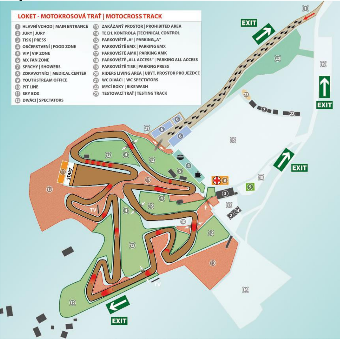
Drawing of the circuit